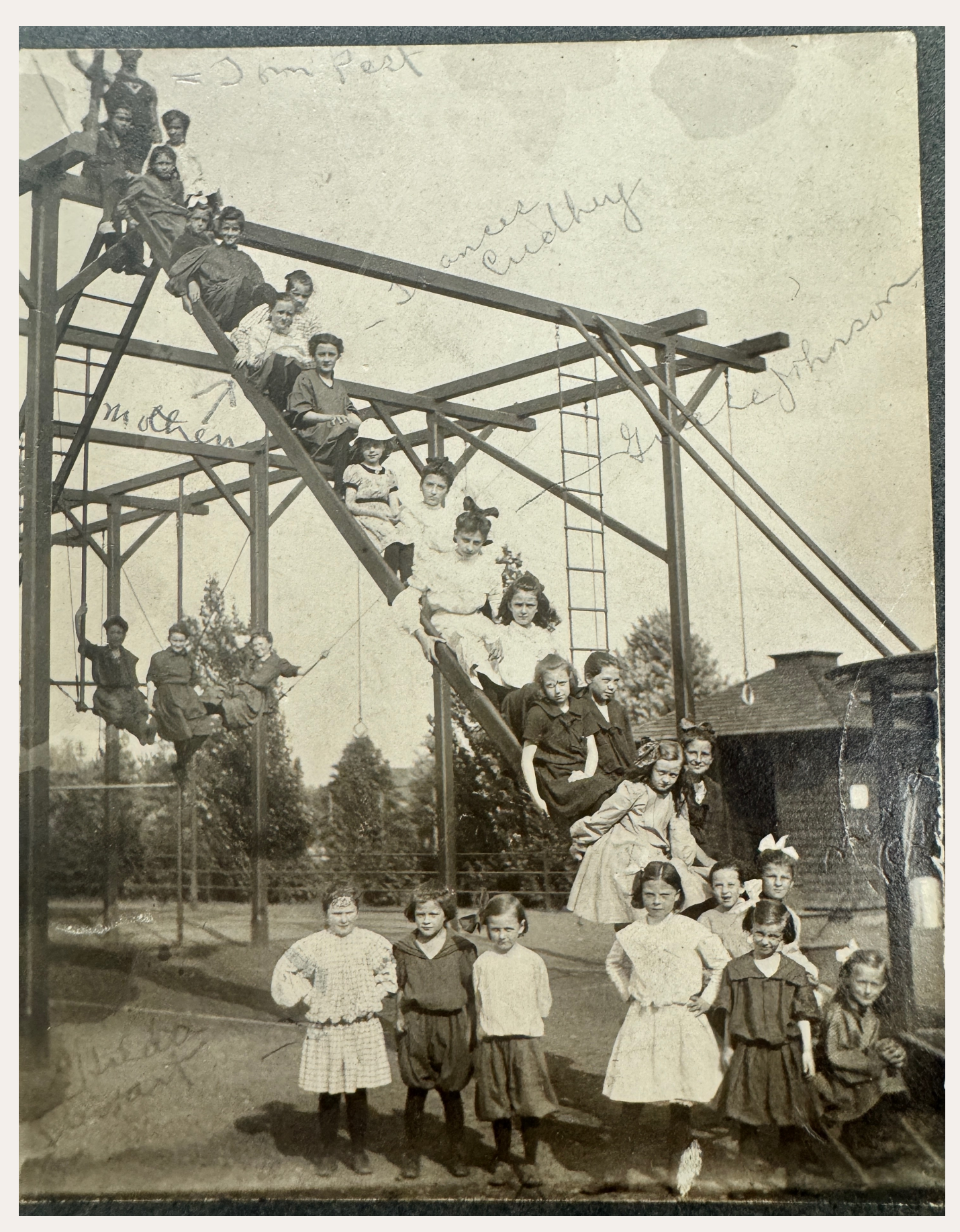
Sonnenberg Playground 1904